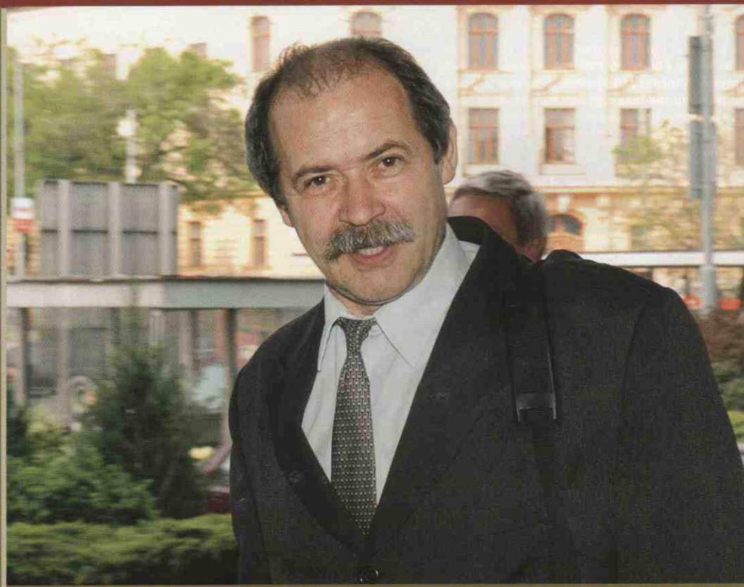
Andrášik today is more hopeful than at any time in the past that the courts will eventually admit all the evidence.